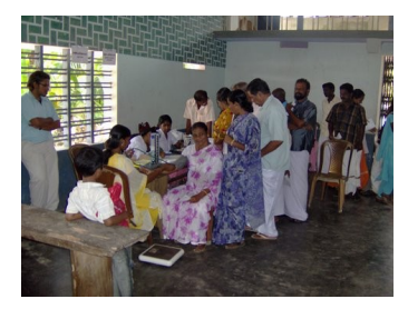
Medical Camp at Chellanam (March 2008)