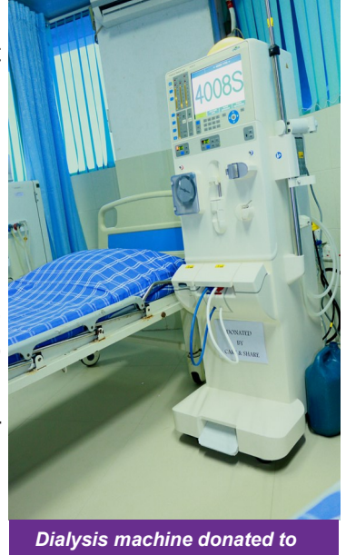
P. S. Mission Hospital

A dialysis machine costs around Rs. 6,00,000 (Appx $10,000) and will function for approximately 5 years. Most hospitals use a machine 3 times a day, 7 days a week. This is approximately 1000 dialyses a year. From the cost of Rs. 1,000 charged for a dialysis, around Rs. 150 is accounted for the cost of the machine and its maintenance.