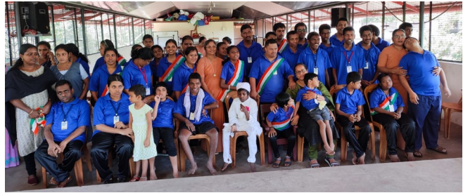
Holy Cross school celebrating children's day

104 special needs kids. With around 20 staff members, the school provides a wide range of services such as CBR, home based rehabilitation, noon meals, vocational training, periodic medical checkups and multiple therapies. Vocational training activities include candle making, book binding, envelope making, fabric painting and screen printing.