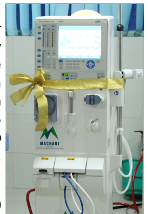
One of the donated machines. Three more will be donated in the first quarter of 2023

Through our partnership with “Stand With Kerala,” we also sponsor 100 dialyses a month at Paalana Hospital ( https://paalana.in/ ) in Palakkad. Apart from this, Care and Share also extends support to CKD patients in Vadakara Co-operative Hospital and Amala Hospital, Thrissur.