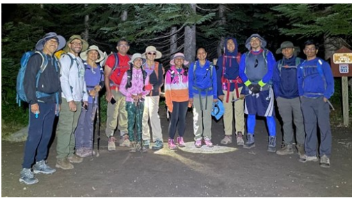
Team starting St. Helen hike at 3:30AM

Upon learning about the financial struggle of the pediatric care provider “Solace” ( www.solaceglobal.org ), a team of seasoned hikers in Seattle decided to dedicate their St. Helen hike to support Solace kids. The initiative was soon supported by other groups such as Seattle Saptaswara, MaChaNi and Art Lovers of America (ALA) WA chapter. In addition, a poker tournament and badminton tournament were conducted as part Microsoft Giving Campaign. Overall, the initiative has raised close to $50,000 so far. The drive will help the accommodation of 100 kids for 5 months registered at the Solace Trivandrum Chapter undergoing treatment in Regional Cancer Center.