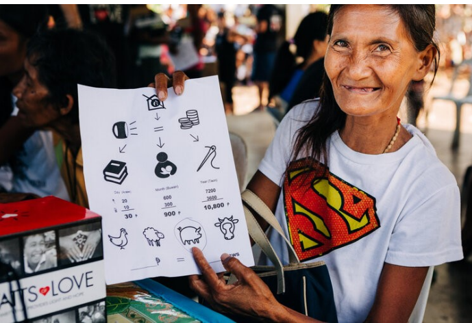
“Watts of Love” trains the community on how to convert savings from their lights into wealth