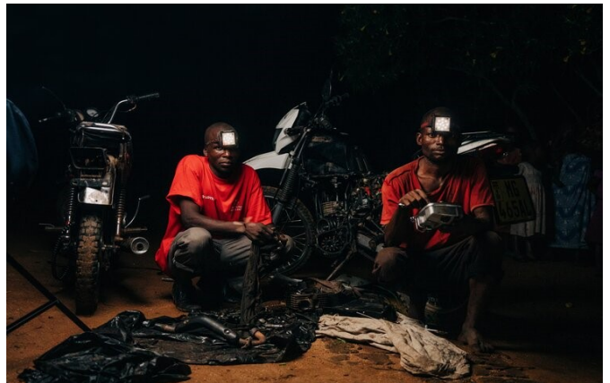
Solar lights help small businesses to function beyond day light hours

We provided solar power to Minga Mission Hospital's maternity ward last year to save the lives of moms and newborns. While working in this project, we realized that electricity is a huge luxury for the people in the Minga region of Zambia. With a population of approximately 140,000, the region mainly uses paraffin, firewood, and torches (made of sticks and grass) for lighting. Apart from emissions and deforestation, these lighting methods can take up a majority of a family's budget in these parts of the world. Trying to solve this problem led us to “Watts of Love”, a non-profit with the unique mission to bring light to these kinds of households. Using their patented solar powered lights, a household can still function in dark hours up to 5 days