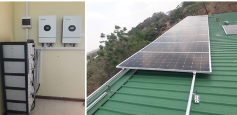
(Pictures while work was in progress) Two maternity ward buildings are now solar powered