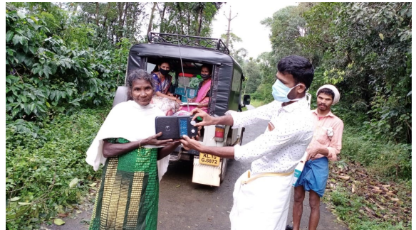
Wayanad health workers distributing radios to 'Asha' workers. COVID and weather forecast news are delivered through 'Mattoli' channel

In Kerala, the district of Wayanad is home to more than 3,000 tribal colonies (hamlets) with a total population of close to 1.5 lakhs (150,000). Most of these hamlets are very remote and do not even use electricity. The main mode of reaching information to these colonies is through the radio channel 'Mattoli', which broadcasts information in the tribal language - a mix of Malayalam/Tamil. Each hamlet has at least one 'Asha' worker, a health care professional trained by the government health department. People living within a hamlet will either visit the respective Asha worker for information, or the worker will spread the news in the colony. Care & Share equipped Asha workers across 825 villages with radios and enough batteries for at least 2 months. Apart from reaching COVID-related updates, these radios also help residents learn about important lifesaving weather information. Sincere thanks to Dallas-based groups 'Stand With Kerala' and 'Ace Lions Club' for their contribution towards the successful completion of this project. A total of $7,500 was spent towards the radios and batteries.