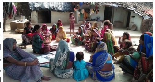
VDS volunteer educating women's group in Banda District

Vidya Dham Samiti ( www.vdsindia.org.in ) is a voluntary non-governmental organization based in the Banda District of the Bundelkhand area in Uttar Pradesh, India. The organization works with some of the most deprived sections of the society, through direct intervention, and advocacy. VDS is engaged in providing food to daily wage workers and returned migrant families hit by the lockdown. VDS provided them with one month's grocery support and helped them apply for ration cards to obtain public distribution system support. Thanks to our supporters from Portland, OR for raising the required $7,150.