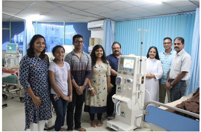
“MaChaNi” volunteers at the dialysis machine handover function