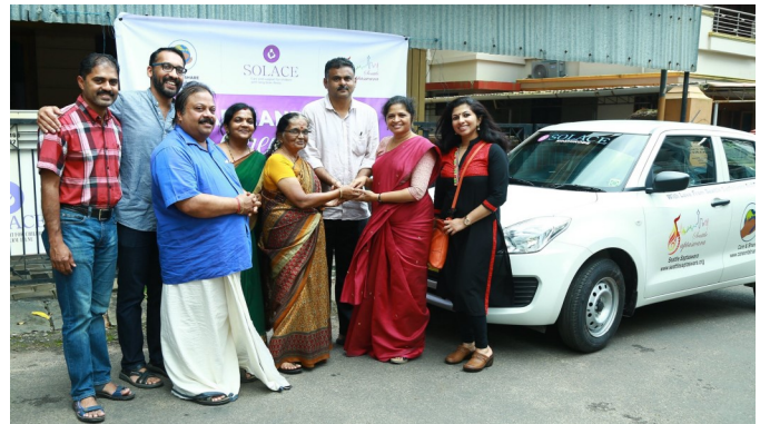
“Seattle Saptaswara” volunteers handover home care vehicle to Solace Calicut chapter

Since 2009, Seattle Saptaswara has been organizing a Malayalam music event “Ganolsavam” in an effort to raise funds to support palliative care patients’ families. This year, Saptaswara celebrated its 10 year anniversary with two mega shows, raising more than $70,000. With Ganolsavam-raised funds, Care & Share was able to donate a home care vehicle for Solace’s Calicut chapter. Pallium India could support the education of more than 250 students of its enrolled patients at various capacities, ranging from primary classes to professional education. Three families either with psychological disorders or chronic kidney problems were living in very unsafe conditions. These families will soon have new houses because of the funds raised by Ganolsavam. The funds also helped a handful of other patients who were undergoing expensive treatments.