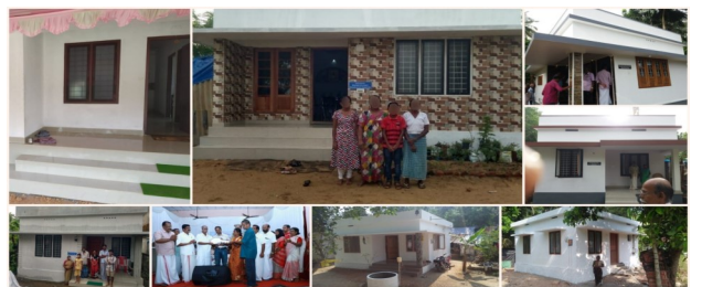
Some of the houses built by Care & Share for the flood victims in 2018 and 2019. A total of 45 houses were built at an expense of $235,000.

Apart from CMDRF, Care & Share worked directly with various organizations to build houses for the flood victims. Spread across Kottayam, Alappuzha, Ernakulam and Thrissur, a total of 45 houses were built in 2018 and 2019 at an expense of $235,000. Priority was given to families with senior citizens, special needs, serious illnesses, and female households. Almost half of the funds came from Google employees through a dedicated drive. Rhythms Studios and Seattle Saptaswara conducted a Tamil fundraiser show in Seattle. During Microsoft’s Giving Campaign, Microsoft volunteers organized a poker tournament. These fundraisers helped to build 10 houses. Please visit our website http://careandshare.com/housingproject.html for more details about this project. We express our deepest gratitude to all our donors and volunteers for helping us to be a humble player in the #RebuildKerala movement.