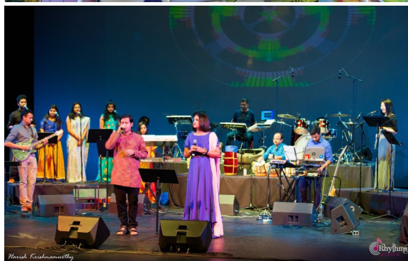
From “Shakthi” music event organized by Rhythms Studio in Seattle