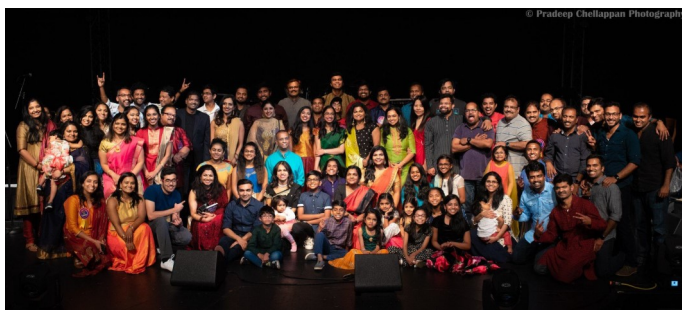
“Ganolsavam 2019” Team

Saptaswara had a remarkable journey in the last ten years, raising a whopping $215,000 during this time frame, positively impacting hundreds of families! The group also partnered with Rhythms Studio to deliver a Tamil show when Kerala was ripped apart with huge floods and hurricane in 2018. Thank you, Seattle Saptaswara -- it's a privilege working with a great team like yours!