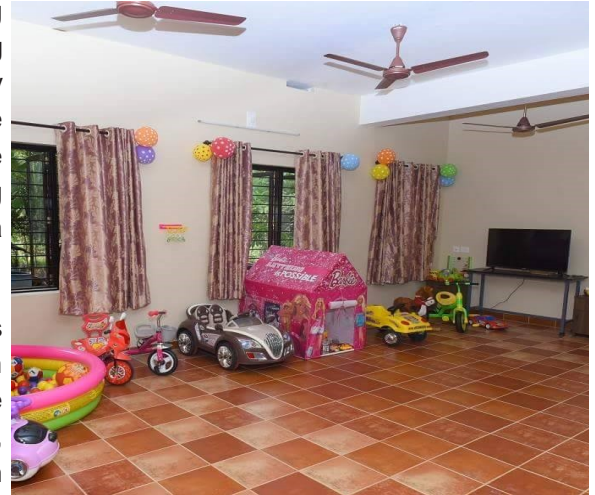
Play area at Solace Respite Center