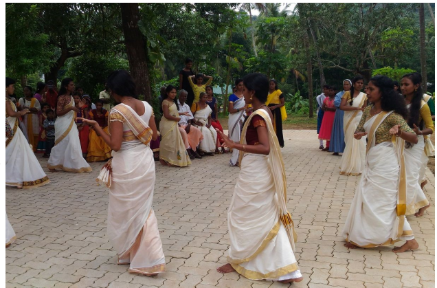
From Chennaipara inmates' Onam Celebration

Chennaipara Ashramam, in Peechi, Trichur, Kerala, run by MCBS missionaries, is home to 345 people, of which 158 are kids. The youngest one is only around 6 months! The inmates belong to different religions and castes, and come from different parts of India, usually by being brought to the Ashramam by the police from the streets and railway stations. Though the education of kids is nearly free during elementary and high school, the educational costs are quite expensive in college, especially if the children are seeking job oriented professional courses. Care & Share began sponsoring Chennaipara Ashramam's college education from 2007 onwards. The educational institutes typically offer a discounted tuition fee, but there is little concession given for food and accommodations. Last year, we contributed $12,000 to support ten students, sponsoring their tuition, food and accommodations. In 2017 one student completed her BDS (dentistry) and started her internship; three others completed three and half years Diploma in General Nursing and started working as staff nurses; and another student completed his B.Sc in Physician Assistant course and joined an MBBS program in the Ukraine. We are proud that we could be part of these students' remarkable academic achievements. This year, the institute has 23 students doing various professional courses at an annual cost of close to $35,000. We will continue our annual support of $12,000. Would you like to be part of their journey?