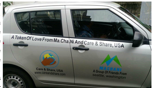
Home care vehicle for Solace