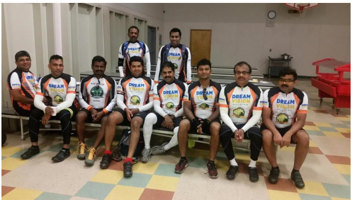
KSC Riders before starting their second day ride

For the third year, Care & Share partnered with Kerala Sports Club in Seattle ( www.keralaclubseattle.net ) to form a team of 15 bikers to ride from Seattle to Portland as part of popular STP 2017 bike ride. Three of the bikers finished 206 miles in one day, the rest of the group finished in two days. The team practiced for around three months to prepare for the ride, and they raised more than $10,250 to improve the special education infrastructure in India. The raised funds were equally split between Adarsh Special School in Ernakulam and Chaithanya Special School in Palakkad. Our sincere thanks to Kerala Sports Club, the riders, the donors, and the corporations who matched their employees’ contributions and provided volunteers.