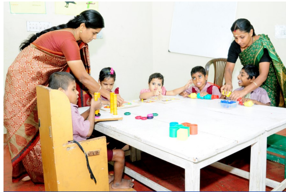
From a classroom session

Chaithanya received funding of $18,150 from Care & Share in the year 2017. We encourage you to visit Chaithanya or a similar school in India to learn more about the challenges faced by these kids and schools. We can help you to get connected with these schools.