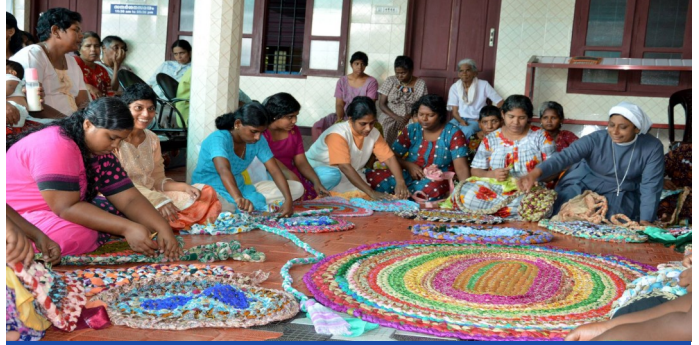
Inmates make colorful rugs from old sarees

In most cities, mentally challenged people wander aimlessly through the streets without recollecting their whereabouts. Rather than just being sympathetic to such people, Rev. Sr. Roselin chose to live for them by starting a shelter for such women, dreaming of a world where no mentally challenged woman wanders through the streets. Snehatheeram is a psychosocial rehabilitation center for mentally challenged, destitute women based in Vilakudy village in Pathanpuram taluk of Kollam district, taking care of 300 women and 8 children. All of the residents were at one time or another brought by the police from railway stations, bus stations and hospitals. Snehatheeram accepts the destitute irrespective of their caste, religion, language or state. The mentally ill or challenged inmates are admitted here under the direction of the police, social workers, and representatives from various legislative bodies and local authorities. Since most of these women are ignored by their family, friends and relatives, Snehatheeram provides them with proper care and protection. More details are available at Snehatheeram’s website: www.snehatheeramcs.org .