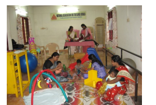
NAB Kerala Training Center