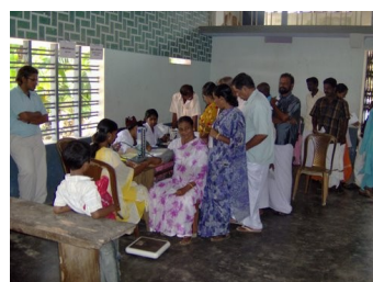
Medical Camp at Chellanam (March 2008)