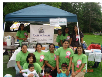
Kerala Association of Washington fund raising food stall for Care and Share NAB Project.

“Care & Share built 20 Rain Water Harvesting Tanks in Methala Panchayat and Chellanam Village for a total expense of $6,000”