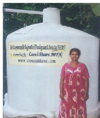
Rain Water Harvesting Tank

“Care & Share built 20 Rain Water Harvesting Tanks in Methala Panchayat and Chellanam Village for a total expense of $6,000”